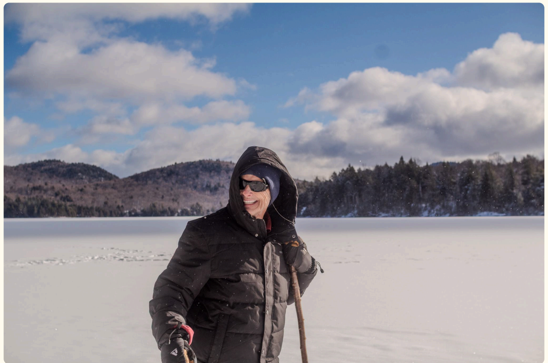
the mary bogos wall